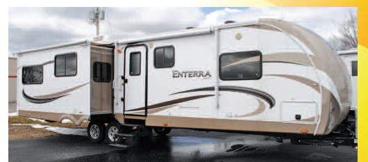
Used 2013 Enterra 314 RES Travel Trailer 3 slideouts, sleeps 6, fireplace, Regular $34,900. SALE PRICE $20,995 Save $13,905 AS LOW AS $189 A MONTH!