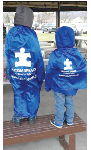
North Country Community Mental Health is sponsoring its 5th Annual Fun Walk for Autism Acceptance on Saturday, April 30 at Veteran's Memorial Park in Boyne City.