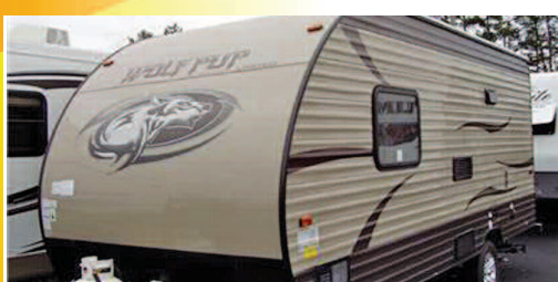
Cherokee Grey Wolf Pup 16 FQ Travel Trailer MSRP $19,672 SALE PRICE $11,995 Save $7,677 AS LOW AS $119 A MONTH!