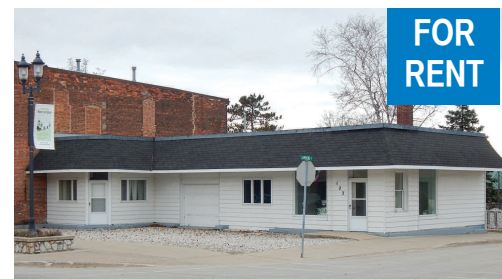
123 MAIN STREET