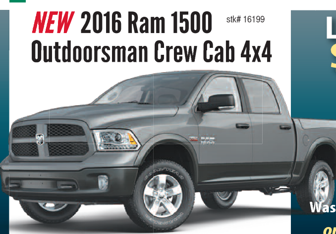
NEW 2016 Ram 1500 Outdoorsman Crew Cab 4x4 stk# 16199

V6 w/305 HP, 8 Speed Transmission, Rear Back-up Camera, up to 22 MPG Hwy & more.