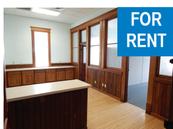
100 MAIN STREET (UPPER LEVEL)