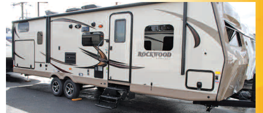
2016 Rockwood 2905 WS Travel Trailer Power tongue jack, outside grill. MSRP $35,858. SALE PRICE $26,995 Save $8,863. AS LOW AS $199 A MONTH!

Most Dump Trailers come with Tarp Kit, Adjustable Coupler and 7 K Jack.