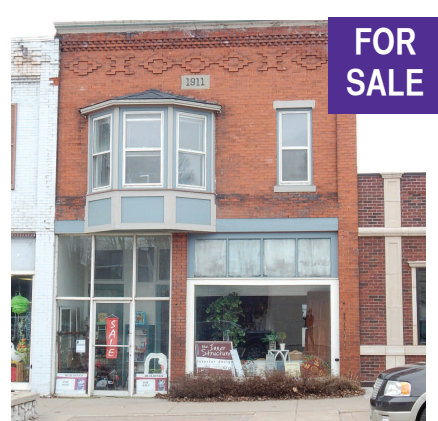
209 MAIN STREET