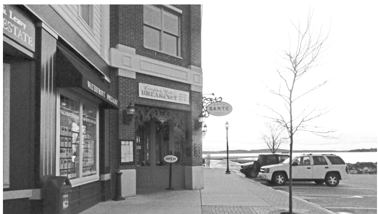
Cafe Sante (pictured here) and other restaurants in Boyne City may soon be allowed to serve alcohol to patrons at tables they have set up on sidewalks.

He furthermore pointed out how much of the steady growth Boyne City has experienced can be attributed to restaurants that have located there and how those