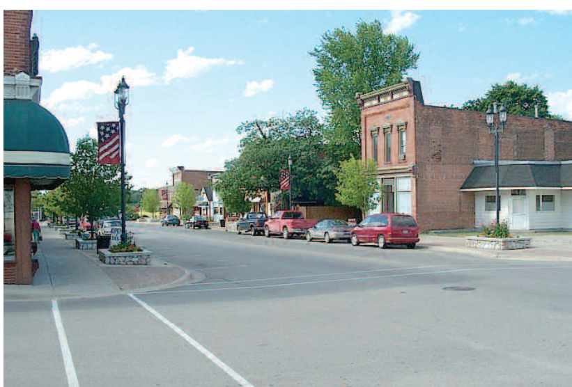
On April 16th the East Jordan Area Chamber of Commerce will be hosting the 4th Annual Business District Open House in the downtown area.