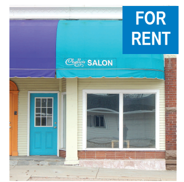
126 MAIN STREET