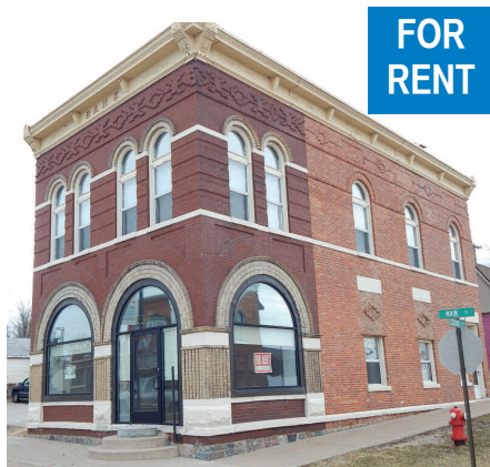
200 MAIN STREET