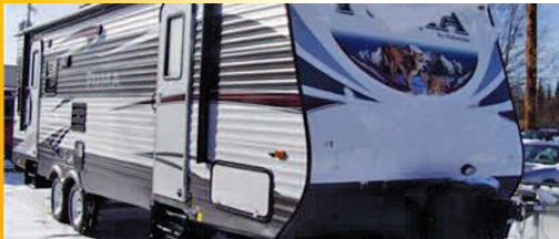
New 2015 Puma 26 RLSS Electric power package, stabilizer jacks, power awning. MSRP $28,663 SALE PRICE $18,900 Save $9,617 AS LOW AS $189 A MONTH!