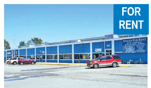
117 S. LAKE STREET