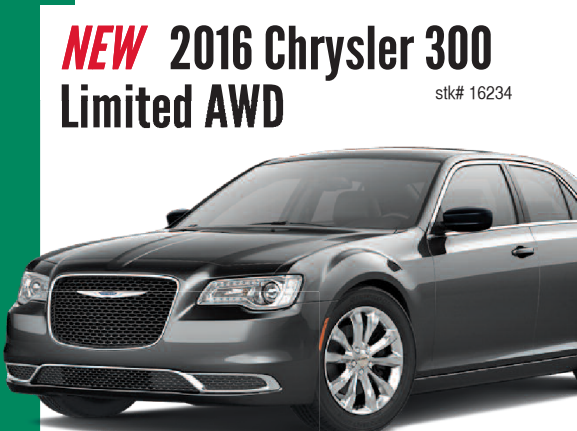
NEW 2016 Chrysler 300 Limited AWD stk# 16234

Heated Seats/Steering Wheel, Remote Start, Rear Back Up Camera, Power roof & more