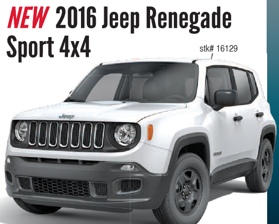
NEW 2016 Jeep Renegade Sport 4x4 stk# 16129

LEASE FOR $357* PER MO. 42 MONTHS 10,000 MILES PER YEAR WITH $2000 DUE AT SIGNING Or Purchase For $28,732* Was $33,570 • SAVE $4,838 or 0% for 60months + $1,000 in Rebates