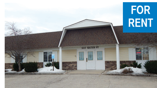
507 WATER STREET