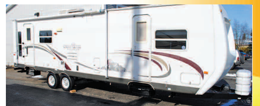
Used 2003 Cedar Creek Silverback 31 RLS Travel Trailer Sleeps 6, slideout. Regular $10,995 SALE PRICE $8,995 Save $2,000 AS LOW AS $119 A MONTH!