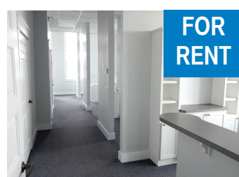
100 MAIN STREET (UPPER LEVEL)