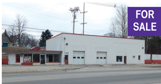
103 STATE STREET