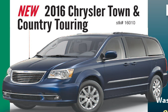
NEW 2016 Chrysler Town & Country Touring stk# 16010

CHRYSLER EMPLOYEES, RETIREES, AND FRIENDS AND FAMILY SAVE EVEN MORE!