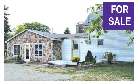
401 WATER STREET