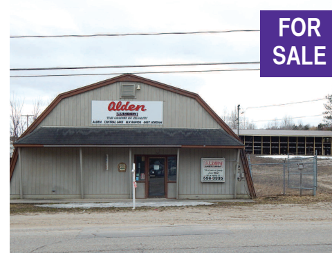
913 WATER STREET