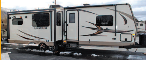
2017 Rockwood 2906 WS ultra lite Travel Trailer Sleeps 5, 3 slideouts. MSRP $37,747. SALE PRICE $29,995 Save $7,752. AS LOW AS $199 A MONTH!

Our selection is growing each day as new 2016 and 2017 units are arriving. Stop by and see what's new for this year. Big discounts this week on new and used RV's and Trailers.