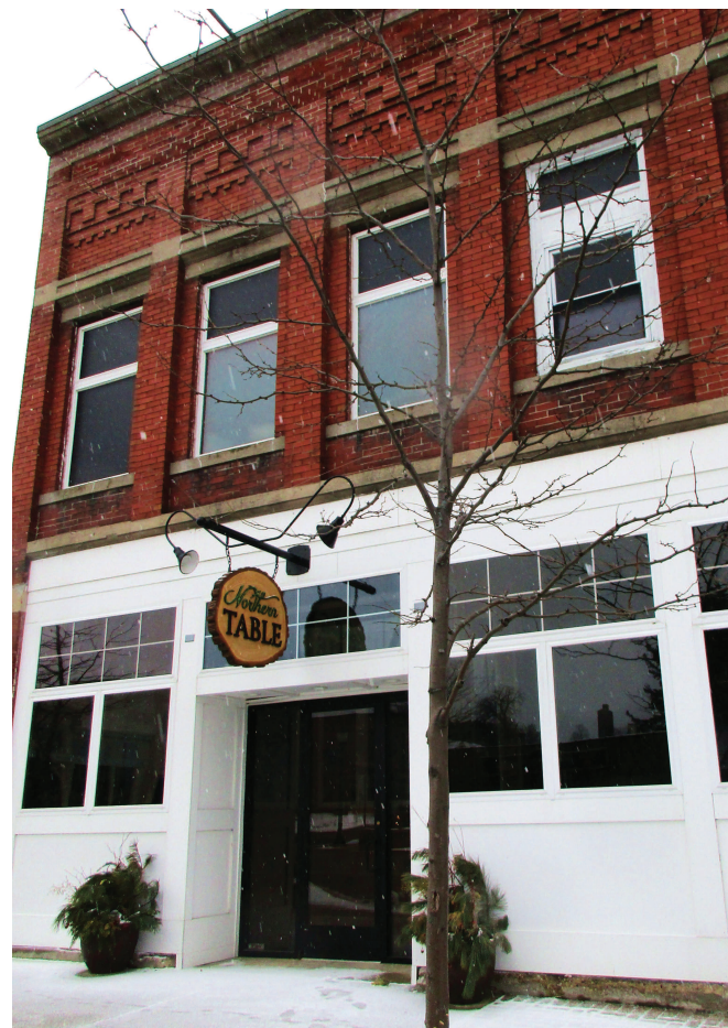
Northern Table restaurant at 220 South Lake Street and the Boyne Pub located just upstairs at the same location in downtown Boyne City stand dark and vacant after they recently and abruptly closed, both having been open for only about a year.

Berrou said they decided the location at 110 Lake Street in downtown Boyne City would be a perfect place to feature the "American meets French" fusion style of baked goods they planned to offer. Not only had the site functioned successfully for years as a resale shop for the local Johan's bakery, but it is situated in the heart of Boyne City's up and coming, busy downtown district, Berrou noted.