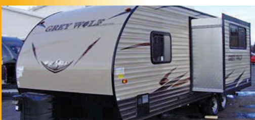
Cherokee Grey Wolf 23 DBH Travel Trailer Bunkhouse, Sleeps 8, slideout. MSRP $26,368 SALE PRICE $16,995. Save $9,373 AS LOW AS $149 A MONTH!