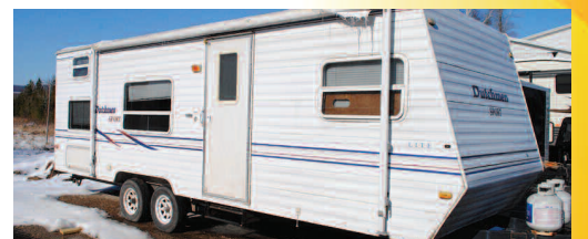
Used 2002 Dutchman 26 Bunkhouse Travel Trailer Rear Bunks, Tub/Shower, Refer, Stove, Sofa Bed, Dinette, Queen Front Bed, and More! Regular $5,995 SALE PRICE $3,995 Save $2,000 AS LOW AS $99 A MONTH!