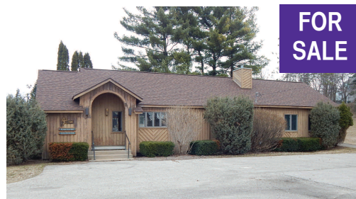
306 MAIN STREET