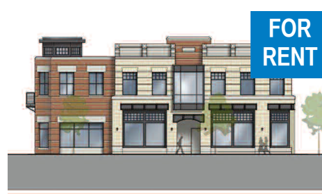
101 MAIN STREET