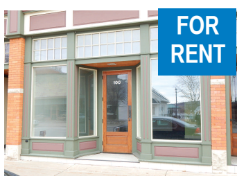
100 MAIN STREET (LOWER LEVEL)